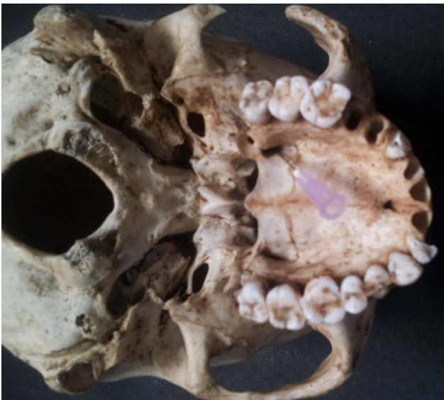
[Table/Fig-4]: Location of greater palatine foramen medial to 3 rd molar and its opening in anteromedial direction on palate